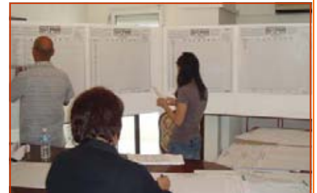
The four precincts during the counting of the ballots.