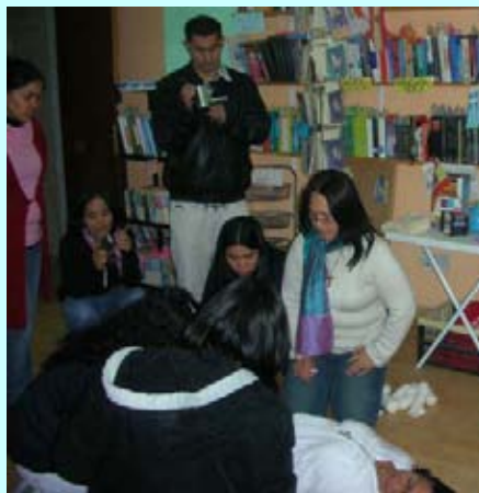
HML trainor supervising trainees for Basic Caregiver Course

Together with the OFW Family Club, one of the biggest Filipino organization in Cyprus assist in monitoring the 5 week course in the three cities every Sunday. ■