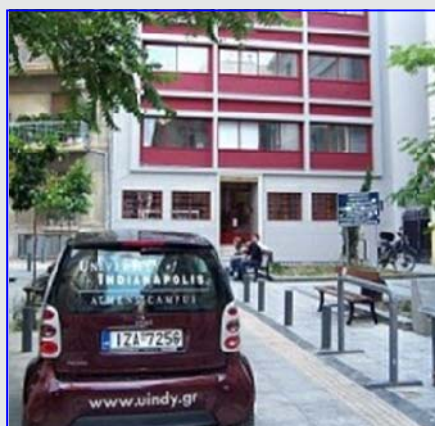
One of UINDY's campuses in central Athens

The University of Indianapolis-Athens is not merely a franchise or a branch of the American university. It is academically and legally categorized as a campus of the university.