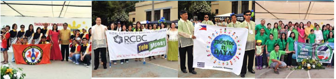
(From left to right) with Pinoy Tempins Bowlers in Athens (PTBA), RCBC Tele Money, Timluyog Ti Daya and Visayas Mindanao Migrants in Greece (VISMMAG).