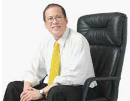
President Noynoy Aquino.

He was subsequently re-elected to the House in 2001 and 2004. In 2007, having been barred from running for re-election to the House due to the term limit, he was elected to the Senate in the 14th Congress of the Philippines.